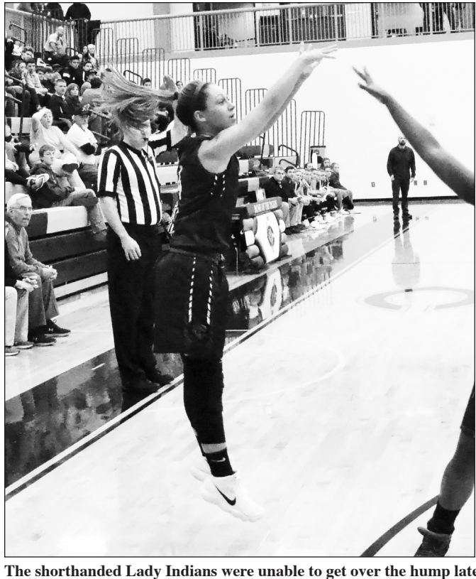
The shorthanded Lady Indians were unable to get over the hump late at Commerce and vs Athens Academy.