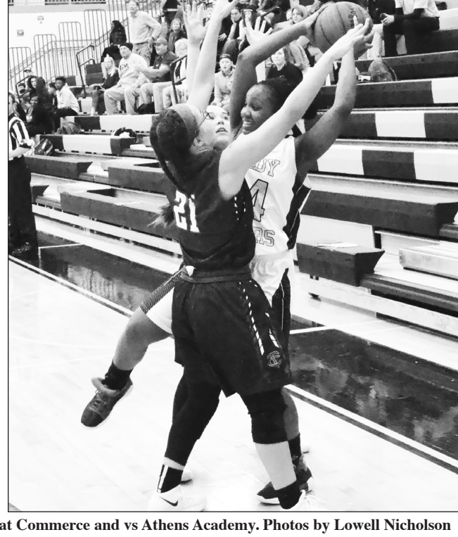
first five of the fourth for what appeared to be a comfortable lead of 53-39 with 7:01 left in the game but no one informed the Lady

Once again, the Lady Ti-The Lady Tigers finished gers struck back with the final the quarter on a 7-0 run of their six points of the quarter and the